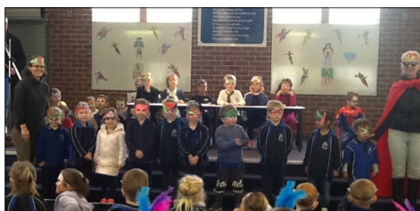
Kindy class with their superhero masks