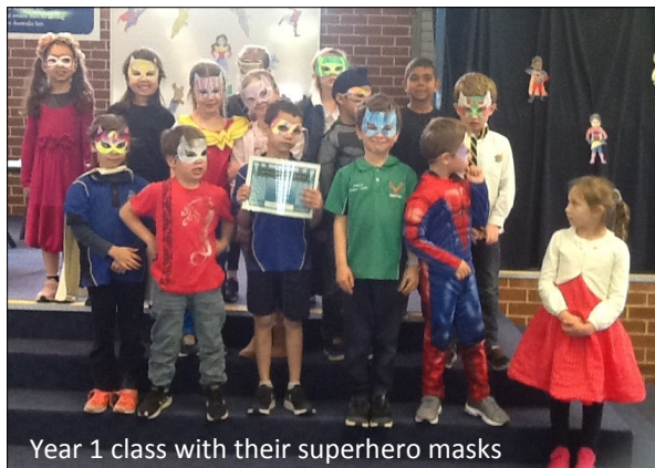
Year 1 class with their superhero masks