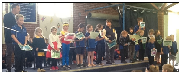
Certificates of Commendation recipients

Certificates of Commendation were presented to some very worthy recipients at the assembly and as a finale each class paraded their super-hero masks they had made in class.