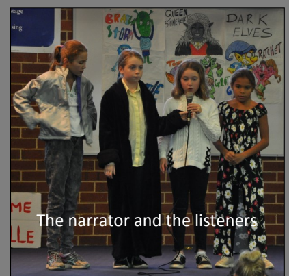
The narrator and the listeners