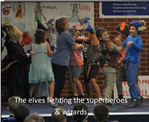
The elves fighting the superheroes & wizards