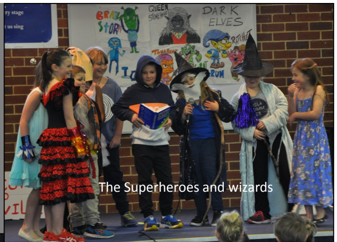
The Superheroes and wizards

When assembly day arrived we presented our best performance yet!