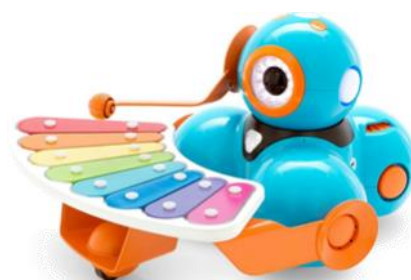
Dash & Dot