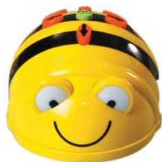
Sphero & Bee Bot