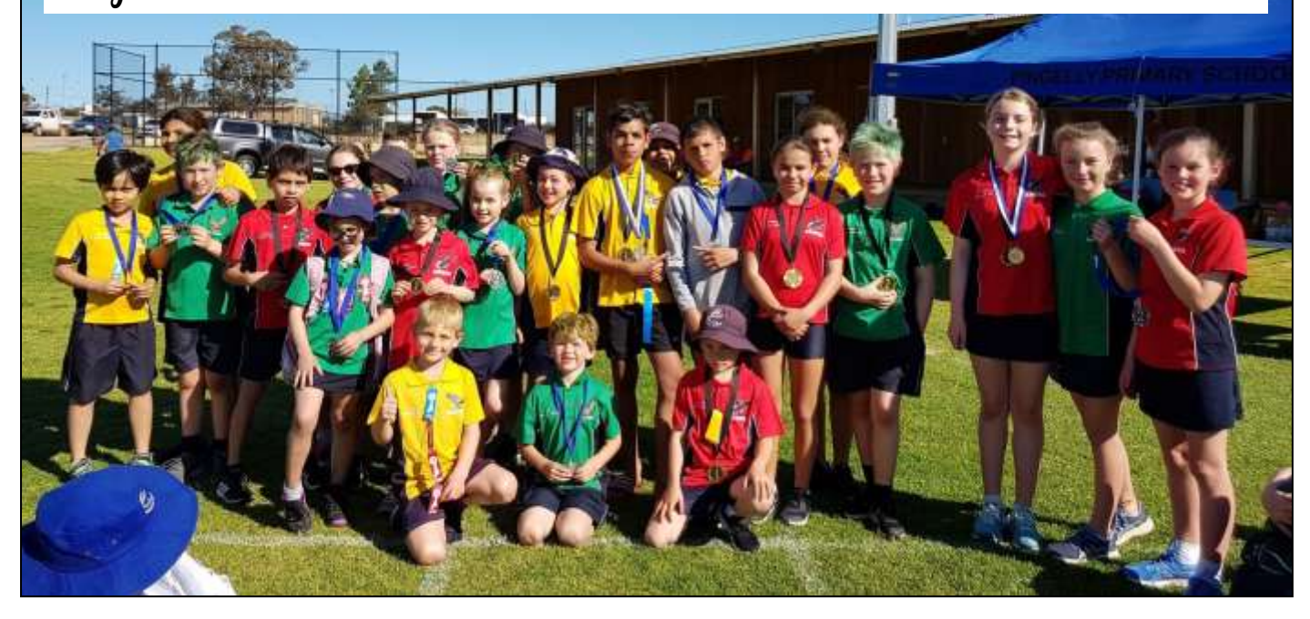
Congratulations to the champions and runners-up at the 2020 Athletics Faction Carnival held last Friday.