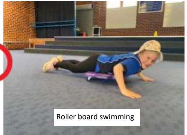
Roller board swimming