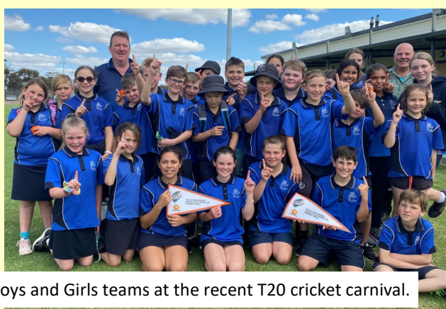
The enthusiastic supporters and the successful Boys and Girls teams at the recent T20 cricket carnival.