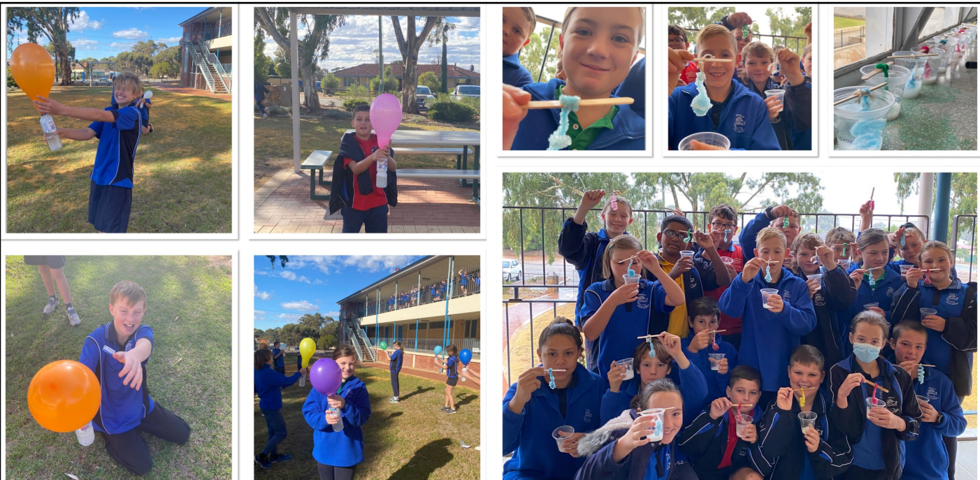
Blowing up balloons using vinegar and bi-carb.