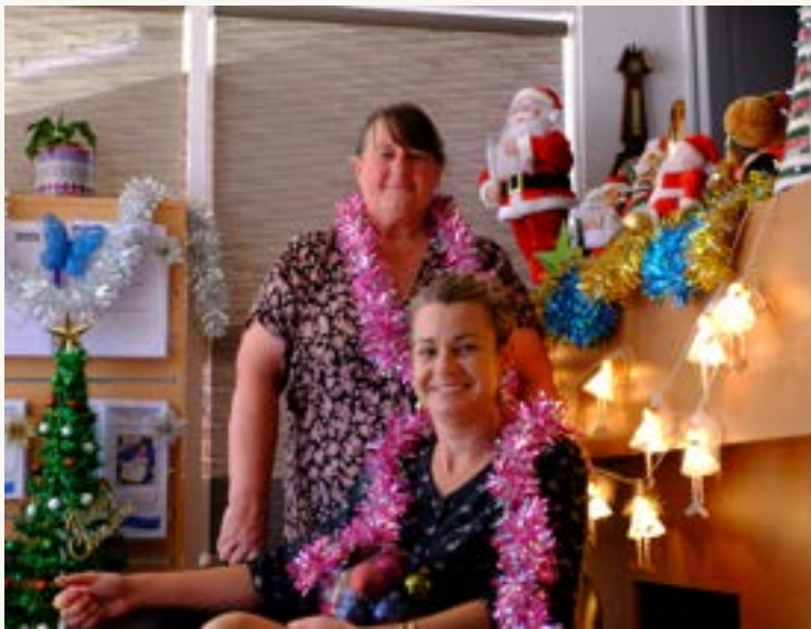
Photos above were taken by reporting students using an SLR camera during the Desert Light Photography Extension Session.