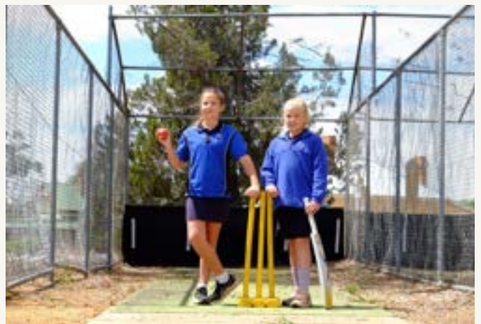
Photos above were taken by reporting students using an SLR camera during the Desert Light Photography Extension Session.

Congratulations to Penelope & Jarrah for both winning MVP (Most Valued Player) of the day. Well done to all the competitors for participating in the day and a huge thank you to all the parents who helped out & came to cheer us on.